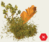
NO Green Waste