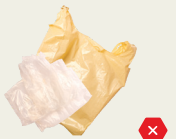
NO Loose Plastic Bags, Bagged Recyclables or Film Empty recyclables directly into your cart