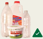
Plastic Bottles, Jugs, Jars & Tubs